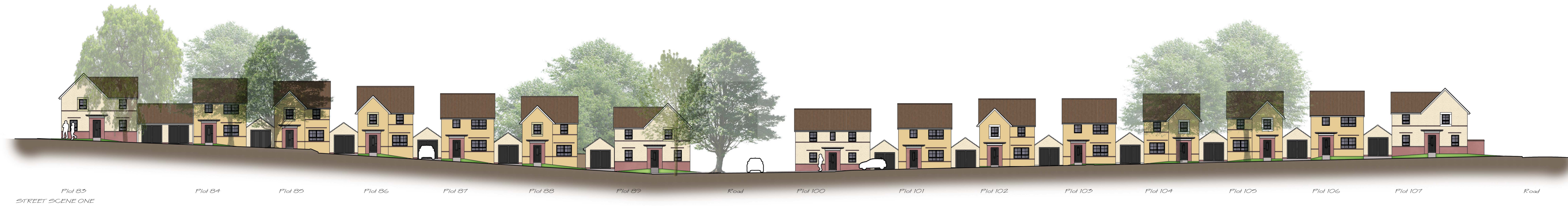
Plot 83 Plot 84 Plot 85 Plot 86 Plot 87 Plot 88 Plot 89 Road Plot 100 Plot 101 Plot 102 Plot 103 Plot 104 Plot 105 Plot 106 Plot 107 Road