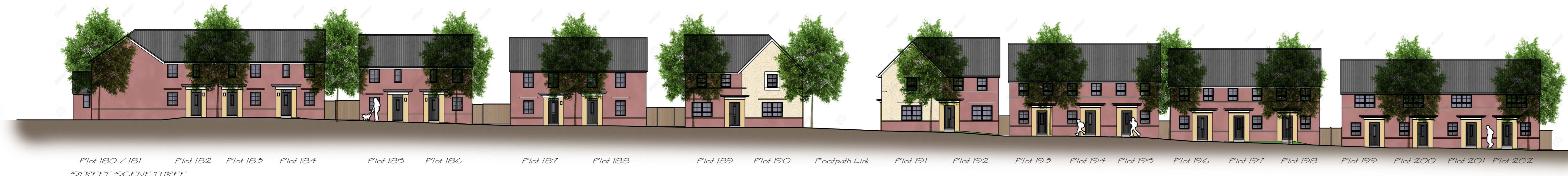
Plot 180 / 181 Plot 182 Plot 183 Plot 184 Plot 185 Plot 186 Plot 187 Plot 188 Plot 189 Plot 190 Footpath Link Plot 191 Plot 192 Plot 193 Plot 194 Plot 195 Plot 196 Plot 197 Plot 198 Plot 199 Plot 200 Plot 201 Plot 202