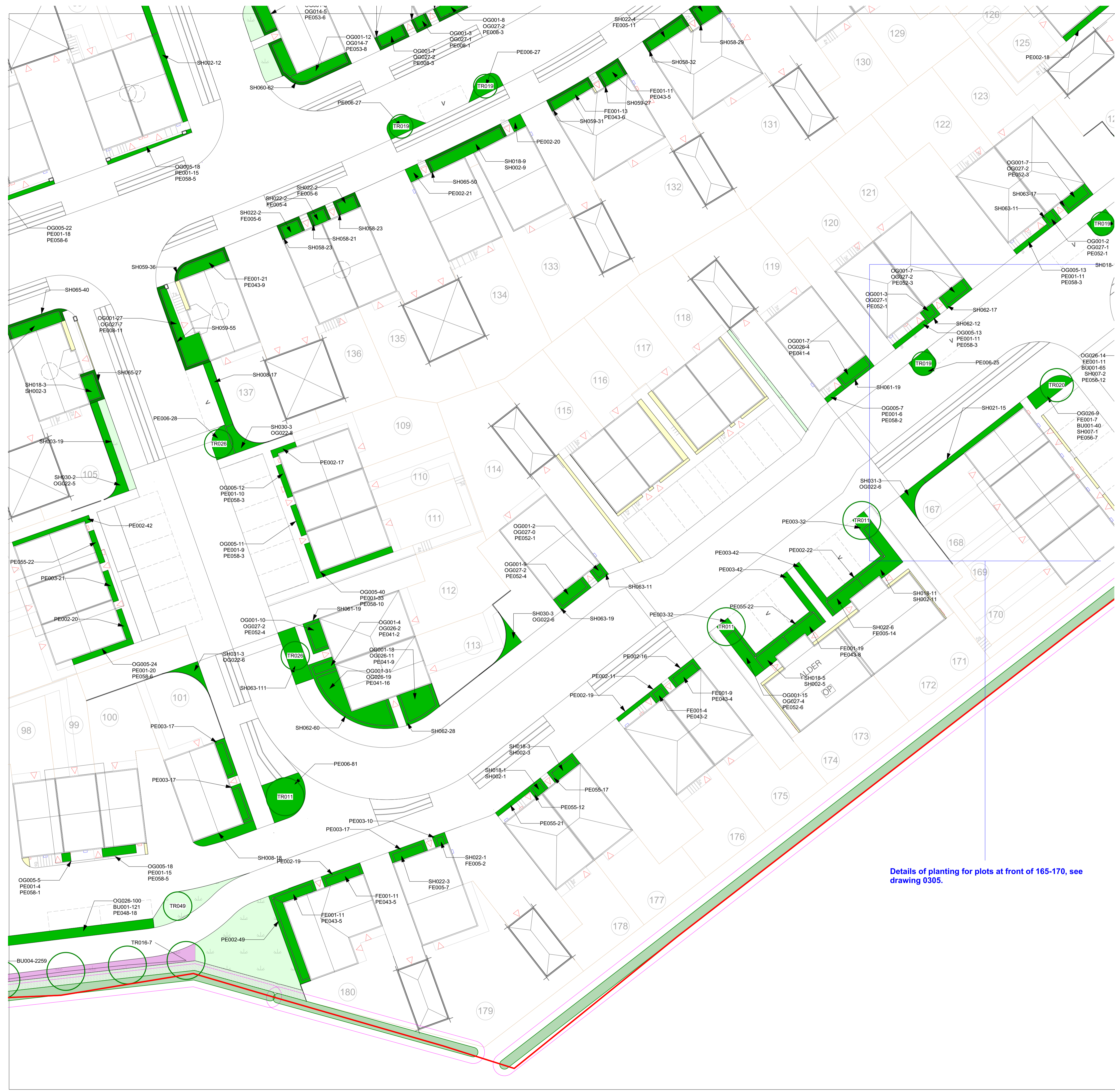
Details of planting for plots at front of 165-170, see drawing 0305.